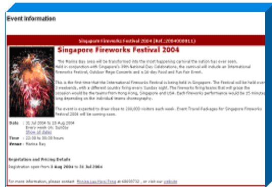
Event information published for viewing and registration